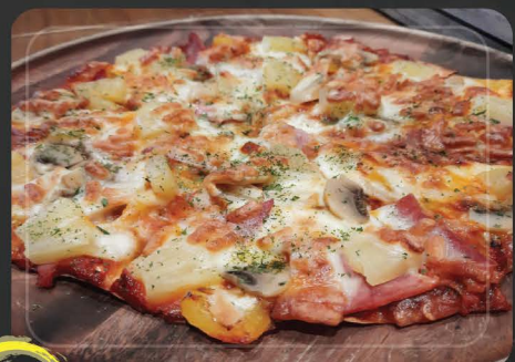
F3 PINEAPPLE AND CHICKEN PIZZA