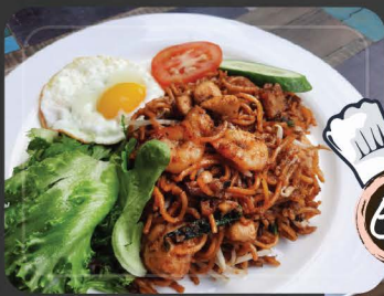
SIGNATURE MEE MAMAK