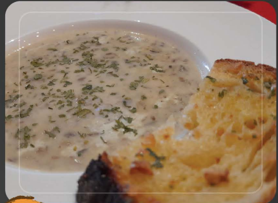
B2 HOMEMADE CREAMY MUSHROOM SOUP