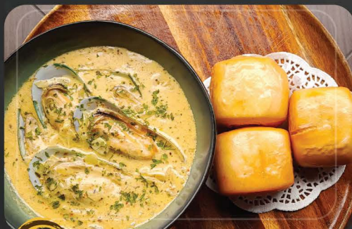
C5 CHILLY CREAMY MUSSEL

Mussel cooked in butter cream sauce with sautéed onion and chili flakes served with mantou.