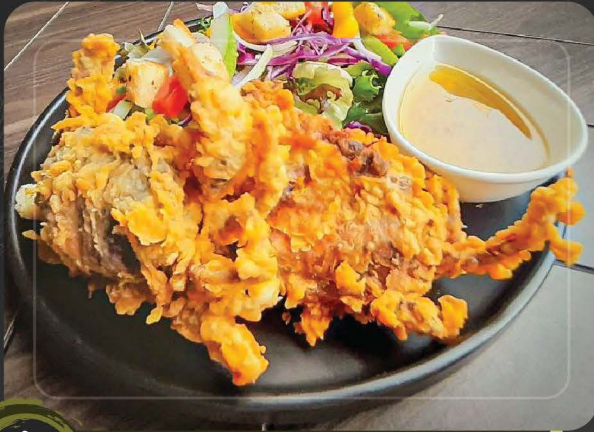
A2 SOFT-SHELL CRAB SALAD