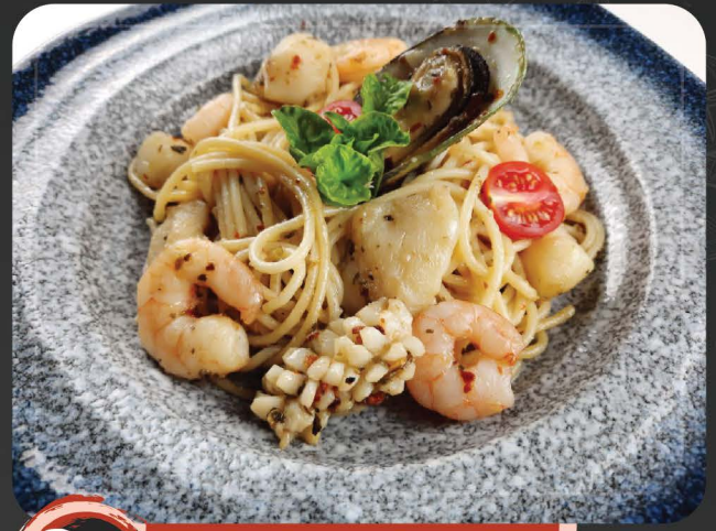
D1 SEAFOOD AGLIO OLIO SPAGHETTI