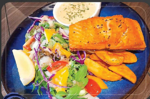
C1 PAN SEARED SALMON